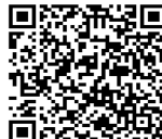
TABLE TIME: 11:10 a.m. - 12 p.m.